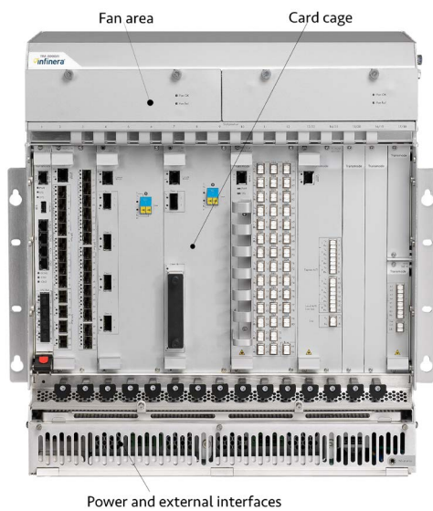
Fig 1. TM-3000/II Chassis.

Up to eight TM-3000/II chassis can be combined to form large NEs with the same IP address, and thus can be managed as one entity. This is done by selecting one chassis as master and connecting the remaining chassis as slaves.