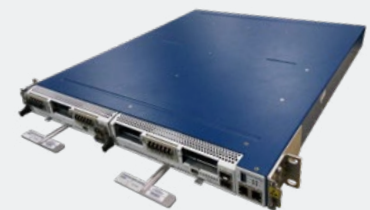
Infinera Groove G30 Open Line System (OLS)