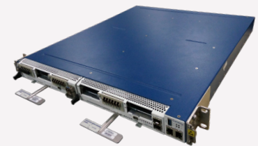
Infinera GX G30 Series Open Line System (OLS)