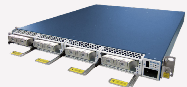
Infinera GX G30 Series Muxponder (MUX)