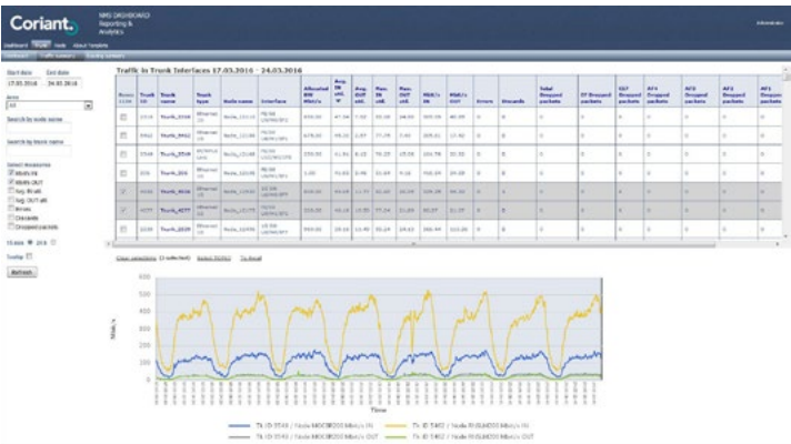
Figure 1: Example of a selected Trunk Traffic view

With an annual subscription, Infinera maintains the entire solution remotely via a secure VPN connection. Installation, upgrades, and maintenance are included in the comprehensive reporting service, as updated NMS and element software release versions are available.