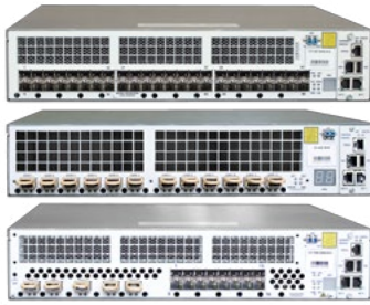
The Infinera Cloud Xpress Family, supporting 10 GbE, 40 GbE and 100 GbE

And Cloud Xpress is very power efficient requiring less than 1 Watt per Gigabit per second (<1 W/G), and keeping power-driven operations costs low.