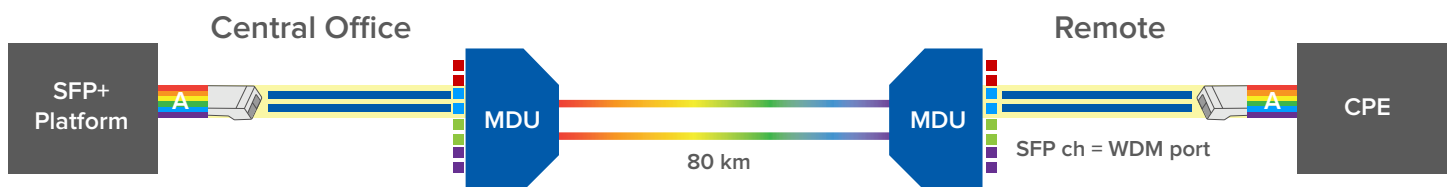
Figure 1: Auto-Lambda basic operation

In the simple example in Figure 1, Auto-Lambda optics are inserted into SFP+-based devices in the central office and the remote CPE. Once inserted, these optics start to scan across the available wavelengths. Here we have four wavelengths – red, blue, green, and purple. The network designer has earlier determined that the blue wavelength will be used for the channel between this particular CPE and the central office, but the technician installing the DWDM SFP+ modules at a later date does not need to know this level of detail. The installer simply installs the SFP+, cleans the transmit and receive fibers, and inserts them into the SFP+ module. At the remote node there will often only be one pair of fibers, greatly simplifying the process as the installer will only need to identify the transmit and receive fibers from the fiber labeling and not worry about the actual wavelength required.