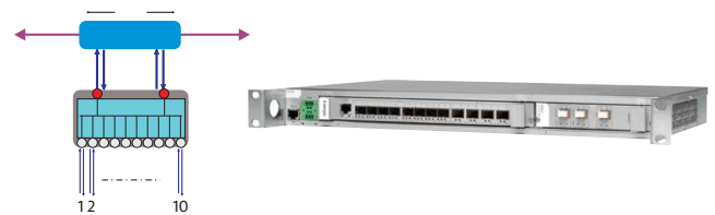
Fig 1. 1U Collector Node with 1+1 Line Protection.

This enables a tailored setup depending on current and future capacity needs of the site.